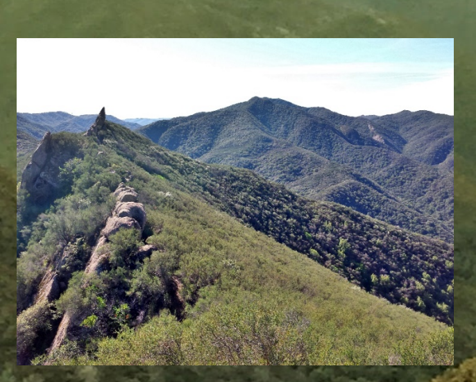
View of the ranch summit (center) from Pleasants Ridge.

The Huber Ranch is 160-acres of gorgeous mountains and ridges, located at the top of Cold Canyon and Wildhorse Canyon, with 360-degree vistas of Lake Berryessa and the Central Valley. We have the opportunity to purchase the ranch, protecting the land and providing for extension of public access from Cold Canyon's trail system.